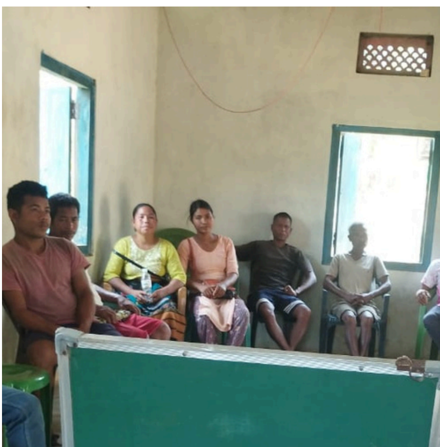
On April 30th, 2024, a meeting was convened by the BPM team for the Teksragre Plantation.