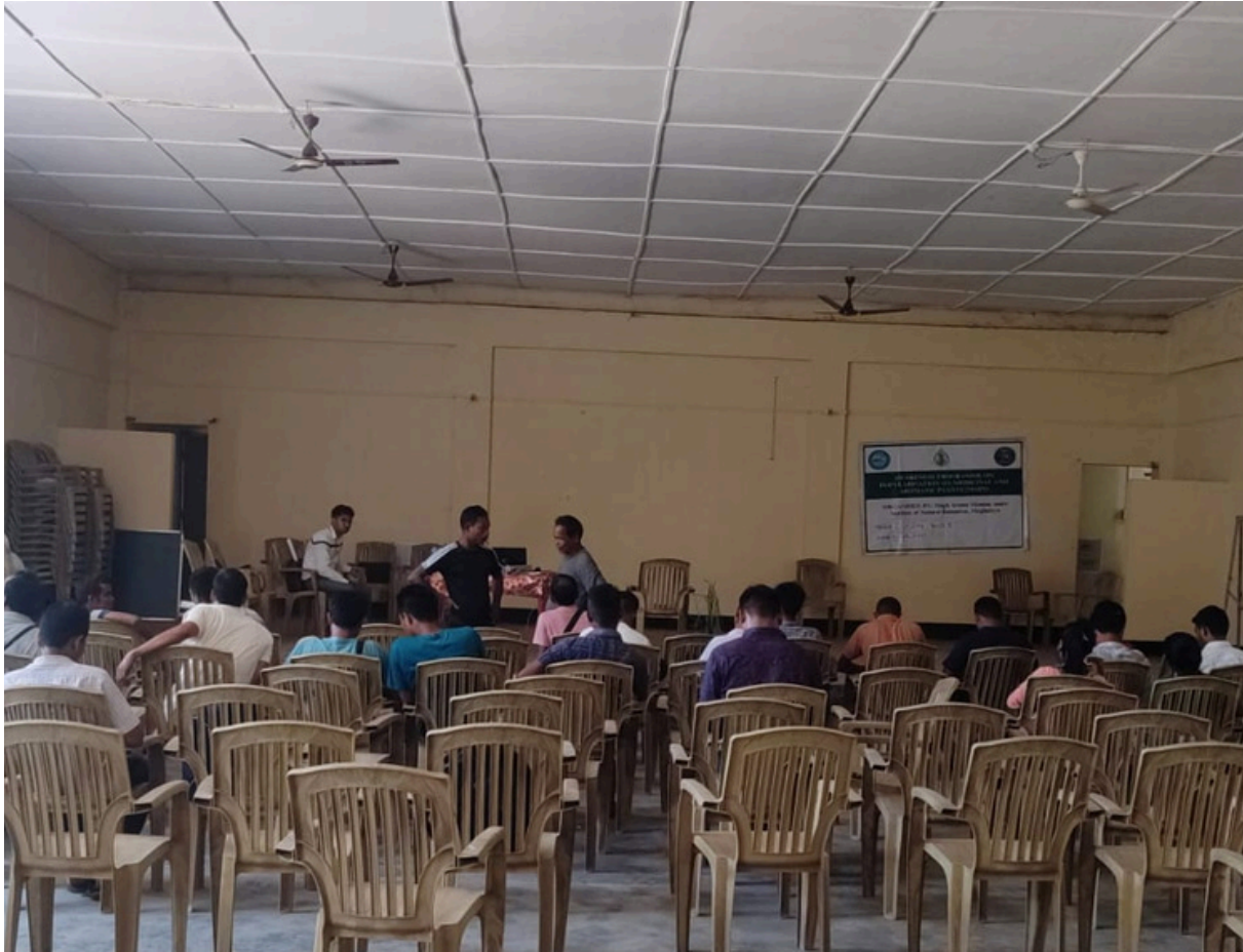
An awareness program on the promotion of medicinal and aromatic plants (MAPs) at Zikzak Block on April 30, 2024.