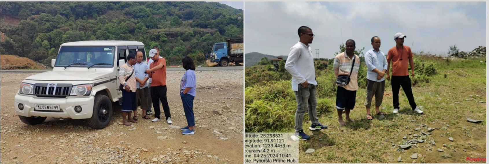
Primehub & Farmers Market site inspection at Pynursla C&RD Block- DPMU & EFC Team on the 25.04.2024