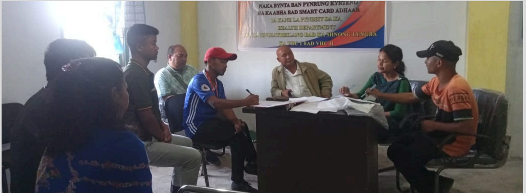
Meeting with Mawlangwir IVCS to discuss on the CMC Business Plan was held on 26.04.2024.