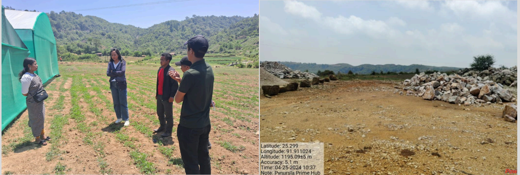
Site inspection on demo plot at Pyndenglitha village on the 26.04.2024.