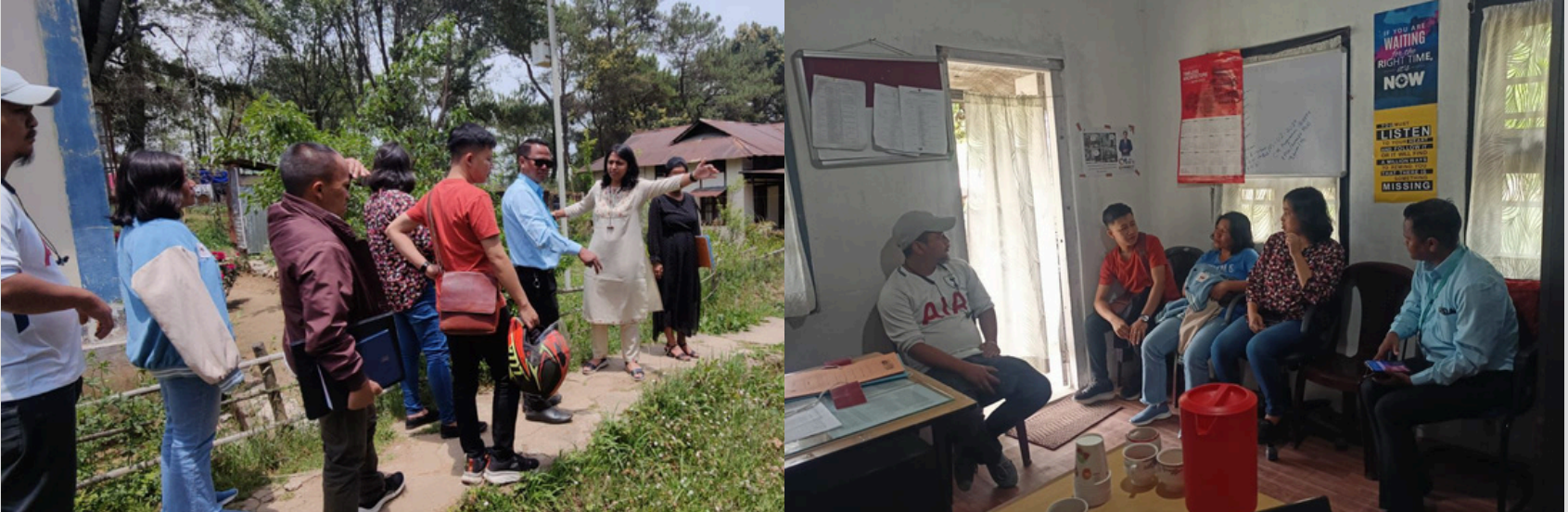
Site inspection for Prime Hub at Myllichem C&RD Block, followed by a meeting at the Block office, Myllichem on the 23.04.2024.