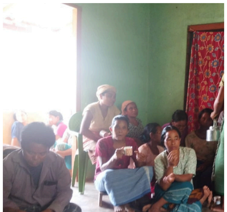
On 30/04/2024, BPM held a Plantation meeting in Manggakgre to monitor their ongoing progress.